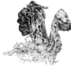
Ink Stipple: Helvella lacunosa Elfin Saddle Mushroom