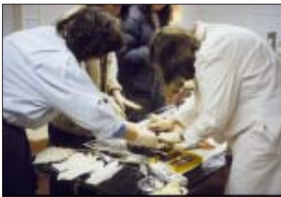
We will do some dissection if there is interest

The ERDC Studio has floor to ceiling glass walls & a large skylight — offering the best bright north light for doing color illustration. The medical workshops here provide the only professional training in medical illustration in the Pacific Northwest.